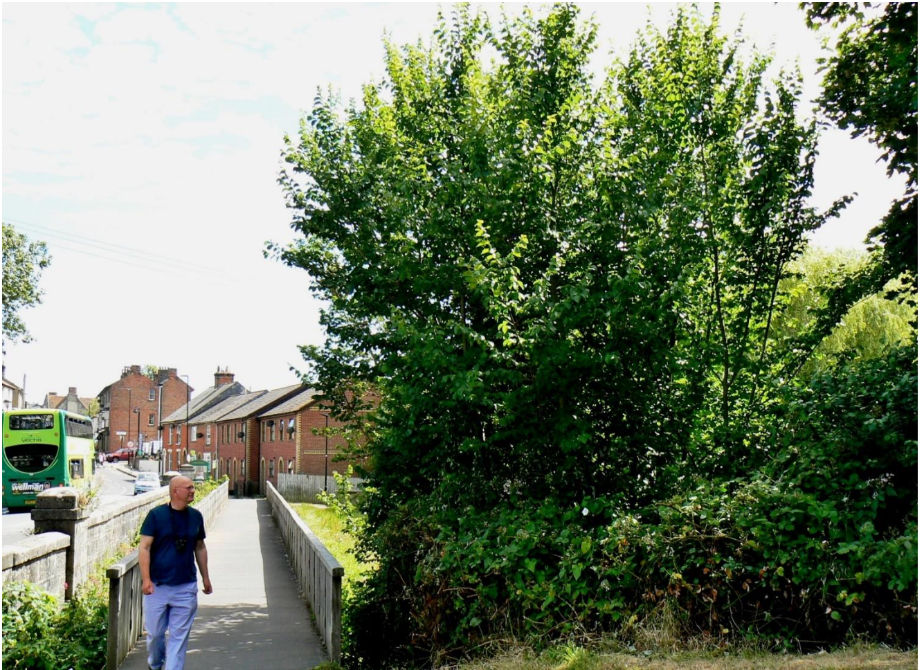
Figure 1. LUTECE elm, Newport, IoW, hosting the WLH in 2015