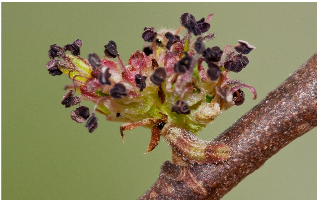
Figure 2. White-letter Hairstreak larva on elm flower.

NB. The French natural history unit VarWild has produced a 14 minute film of the lifecycle of the WLH, with close-up photography: https://www.youtube.com/watch?v=vdDNGF2HDr0